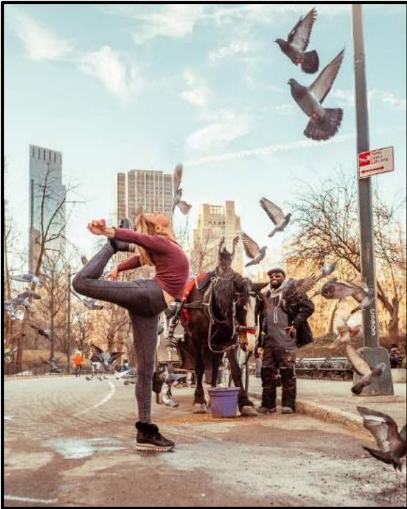
NYC Street Art-Carriage Horse Life