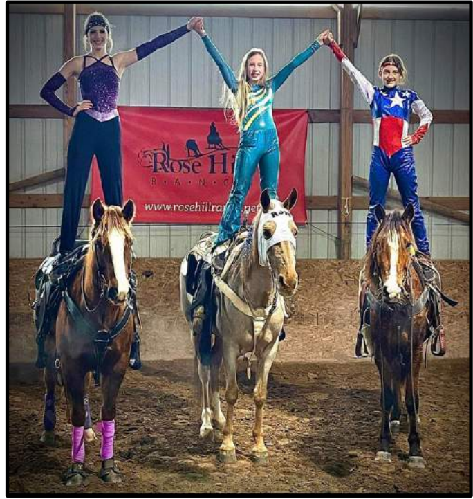
Trick Riders at EquiFest