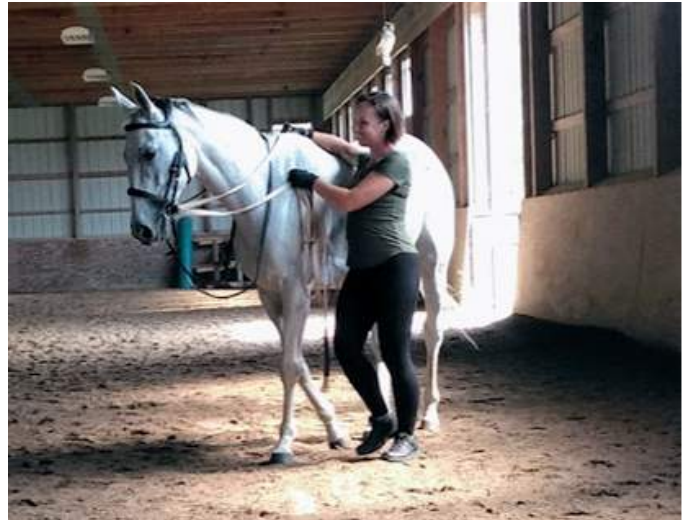
One of the authors students doing groundwork, legs in tandem, both expressions soft and happy.

We and horses can be in sync at the beginning stages of our learning and advanced; horses prefer this state over all others as it offers the most comfortable herd dynamic. If your horse does not want to sync with you, it's up to you as herd leader to figure out why. Maybe riding in circles has bored him to the point where he feels ignored, so he closes his energy to you.