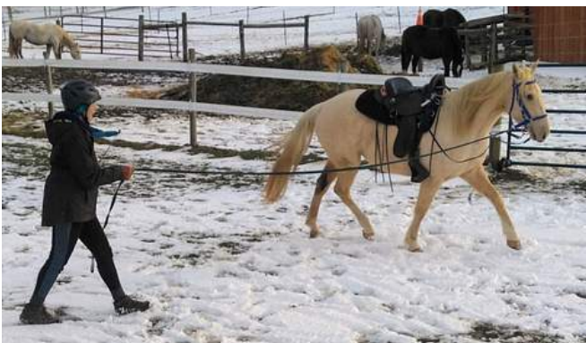
Notice this student's back right leg placement matches her horse's. Also note this horse has no eye on this side, they were in sync by vibrational energy and feel through the rope!

How 'in sync' are you with your day-to-day life? Can you move through your day, meeting coworkers, driving to the store, preparing meals, and finding these little moments of flow, of being in sync with your tasks and surroundings? Just thoughts to ponder, I know away from a horse I tend to struggle much more!