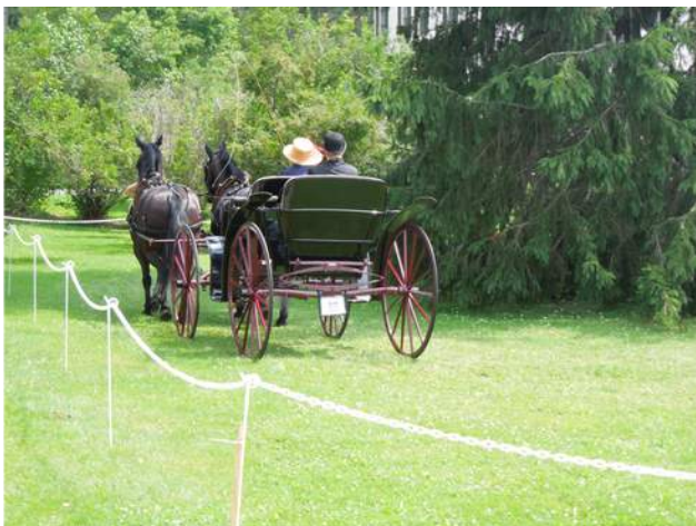
A couple with a pair