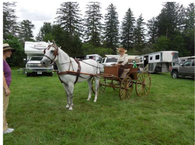
A happy competitor