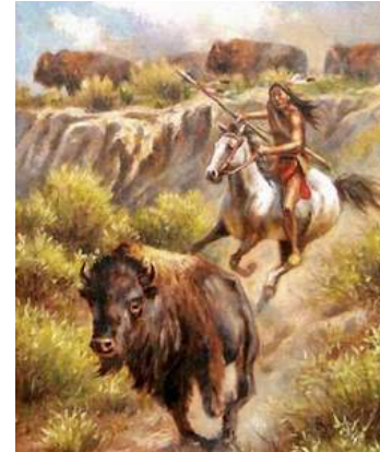
In pursuit of moving target - astride his Appaloosa, native Indian hunting bison

Be it the tent-pegging soldiers of the Indian subcontinent or the native Indian warriors of the Americas, astride their Appaloosas, all ancestral practitioners of this military skill combined a long sharp weapon and a galloping steed along with the indomitable spirit of a warrior. Hence a soldier and a warrior's perspective is a must if the modern-day tent pegger's performance has to improve. The fire that burns for the gold in every tent pegger's heart must be tempered through the steadiness of the seat and hand of the rider and the eye of the rider. Based on my personal experiences while playing and training, the following aspects warrant consideration towards improvement and better scores.