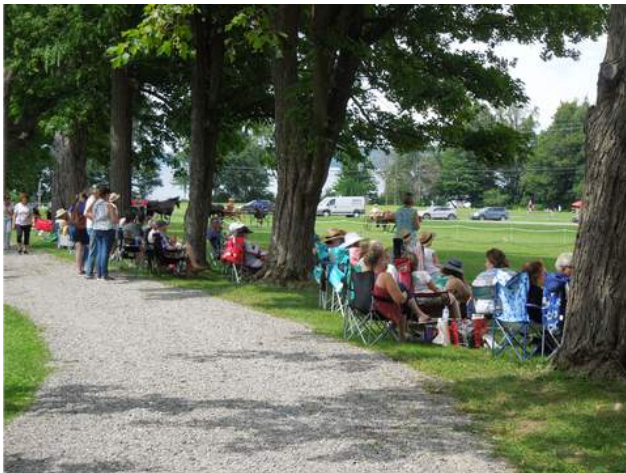
Enjoying the show from the shade of the trees