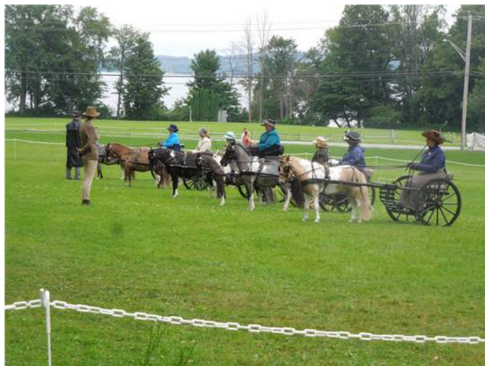
Mini horse put to a cart

Even before the age of the automobile, there were horse shows and competitions to test various types of riding, jumping, and even carriage driving and coach driving. County Fairs were everywhere, with harness racing on the track and draft horses showing conformation and pulling power. Driving horses in harness became a high art, requiring skill and fashion, extending well into the age of the automobile. Never completely dying out, driving classes could still be found in several breed show lists. In my memory, carriage driving and competition began to regain interest in the 1960s and 70s as its own discipline with local driving clubs and the national organizations of the American Driving Society (ADS) and Carriage Association of America (CAA). Some enthusiasts were primarily interested in antique vehicles, and some were more interested in using their horses in harnesses. At this moment, it appears that interest in carriage driving has waned, as has interest in horse shows and breed associations in general, but despite Covid and more than one national financial disaster, there are still significant numbers of horse owners willing and able to gather for equine events.