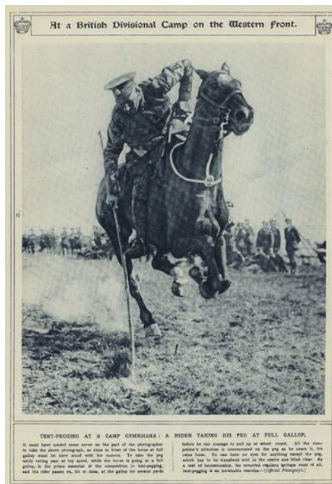
Tent Pegging at camp gymkhana on the Western Front, 1914-18(b/w photo)