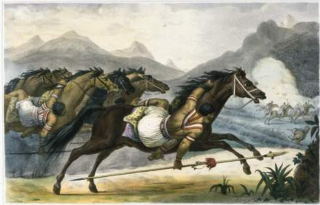
Charge of Cuangurus Indians, 1839 (Lithograph).

Historically, a similar skill was used by bison hunting Indians in the Americas. A 'similar skill' but not a 'same skill' as the bison were a bigger target and a moving target.