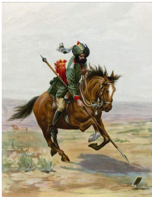
Tent Pegging. Illustration for Chatterbox annual (Wells Gardner, early 20th century). Tent Pegging Indian Cavalry, 1980 (color litho)

Tent pegging is a game of taking a stationary target while mounted atop a fast galloping steed