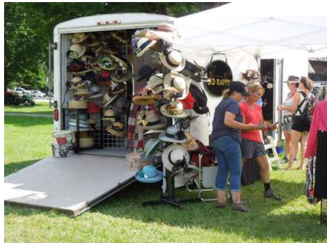
Selecting a new bonnet